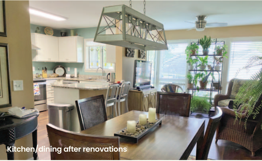
Kitchen/dining after renovations