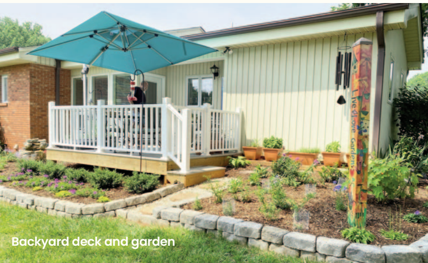
Backyard deck and garden