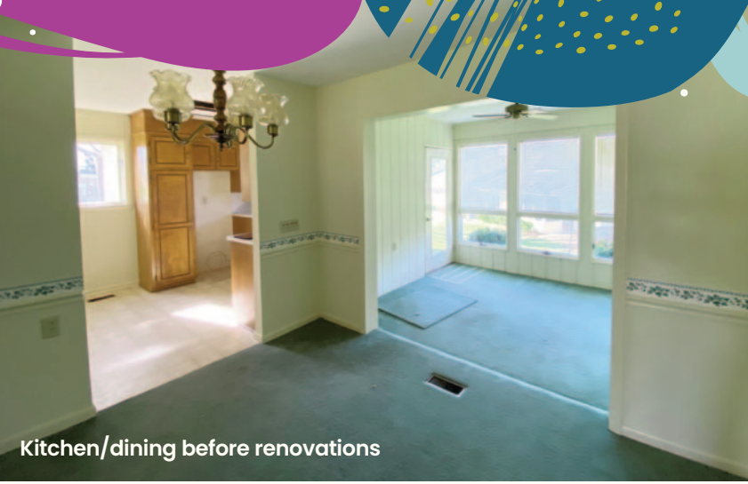
Kitchen/dining before renovations