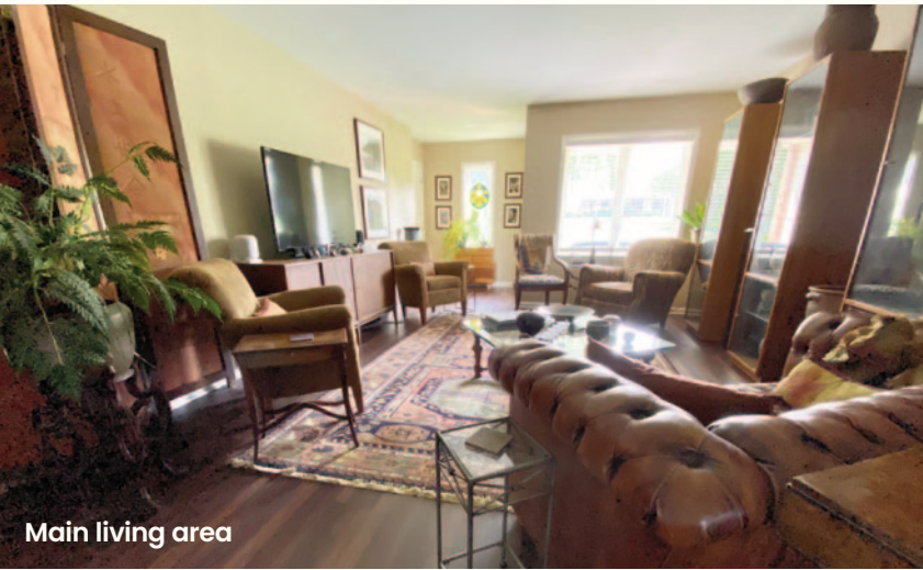
Main living area